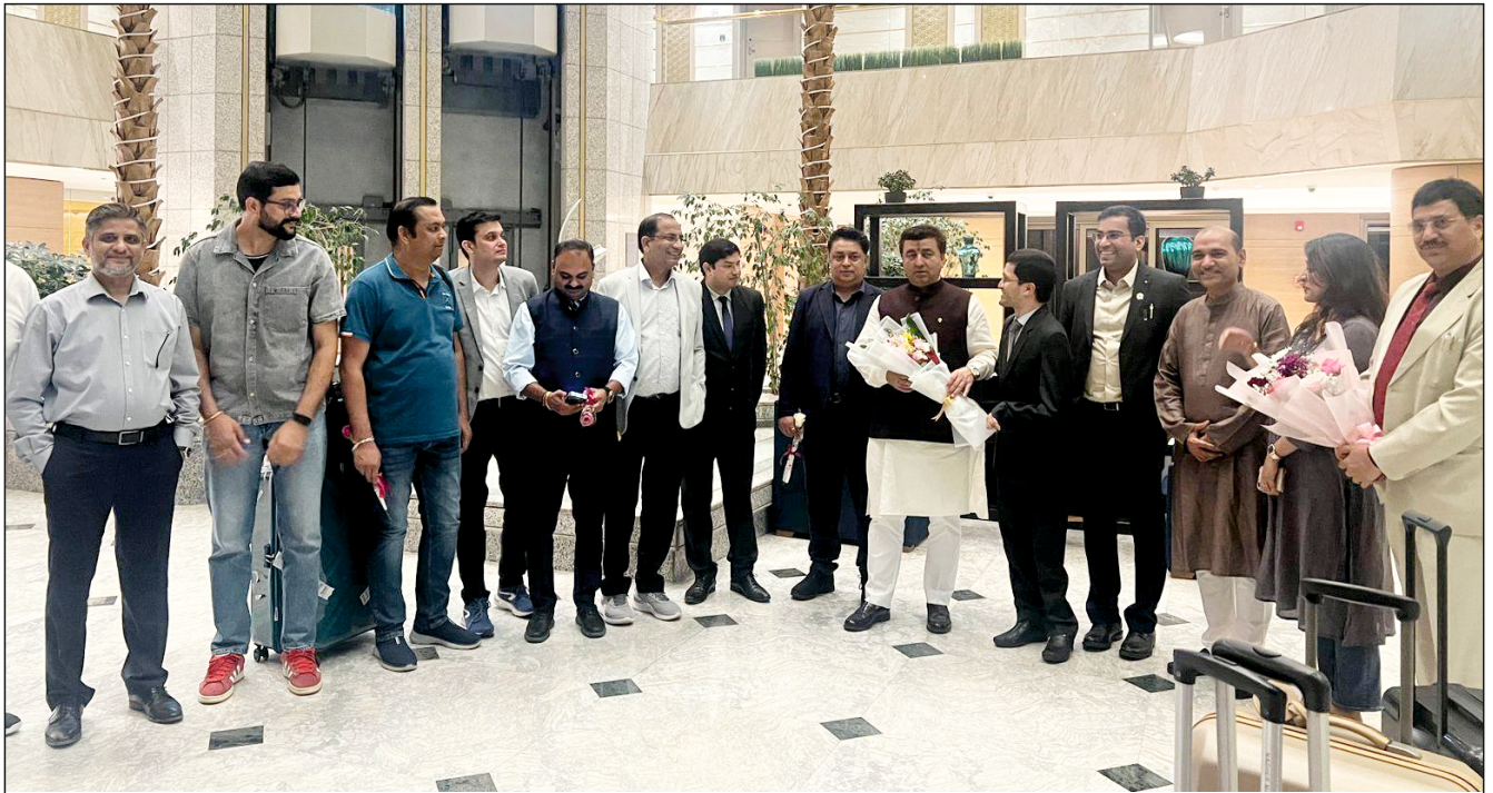
Moments of Rajasthan's Connect in Saudi Arabia