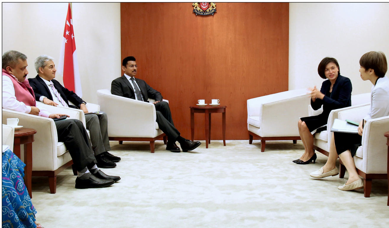
Hon'ble Industries and Commerce Minister, Col. Rajyavardhan Rathore & Senior Officials At Singapore For The Rising Rajasthan Roadshow