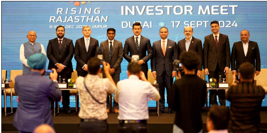
Glimpses of Rising Rajasthan Roadshows in Dubai & Qatar

The Rising Rajasthan Global Investment Summit 2024 roadshows in UAE and Qatar engaged the potential investors and Non-Resident Rajasthanis (NRRs), strengthening economic and cultural ties. Led by Hon'ble Industry and Commerce Minister Col. Rajyavardhan Rathore, the Dubai event drew