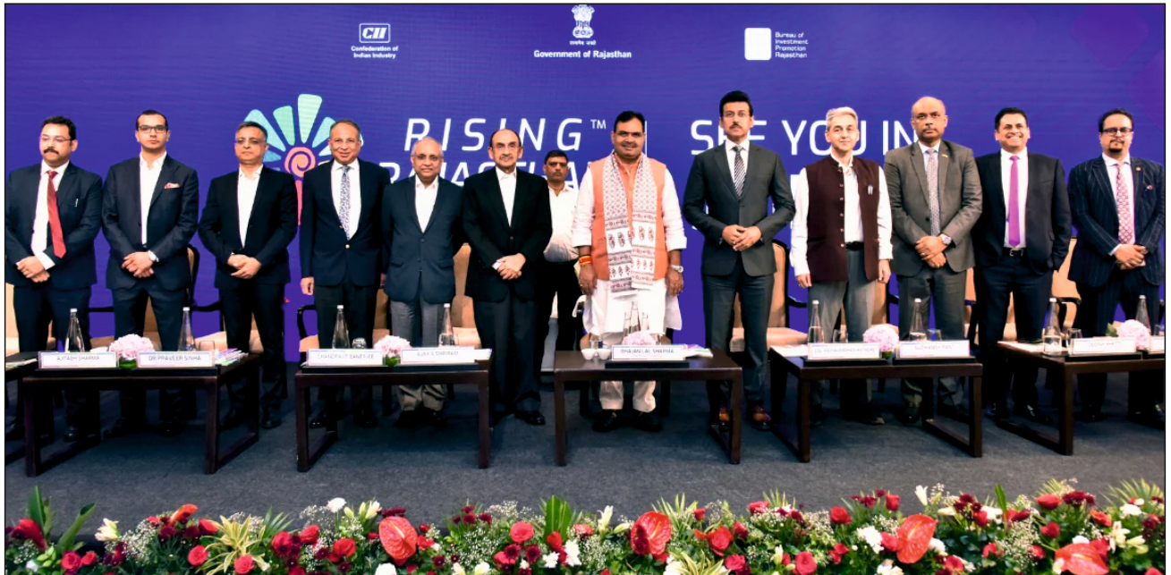
Hon'ble Chief Minister Shri Bhajan Lal Sharma & Dignitaries at the Series of Events in the National Capital