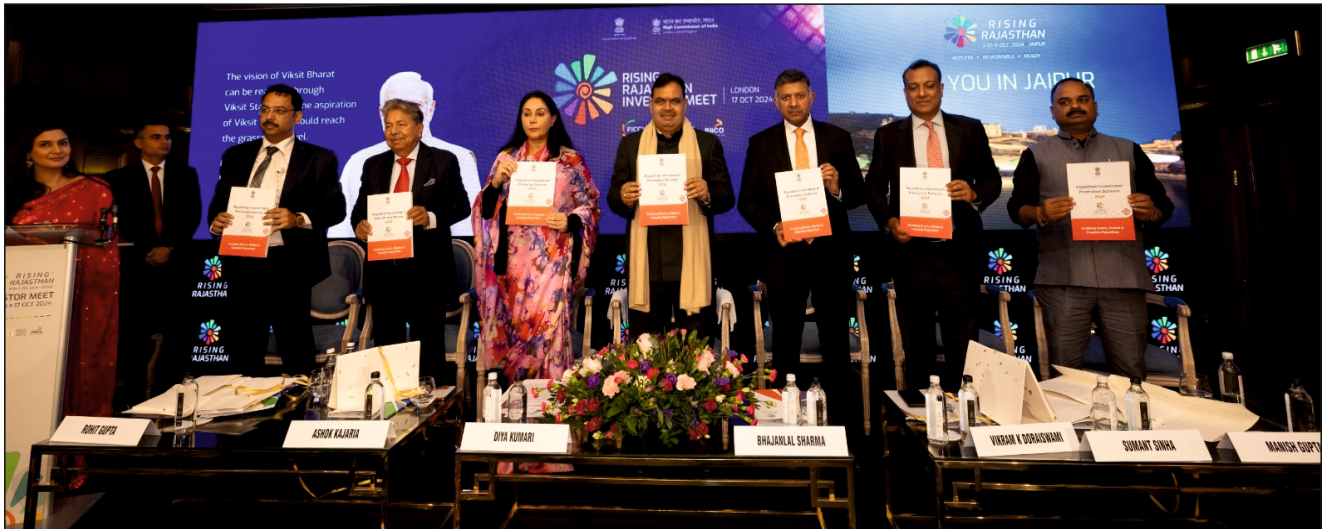
Hon'ble Chief Minister Shri Bhajan Lal Sharma, Hon'ble Deputy Chief Minister Ms. Diya Kumari & Dignitaries At London in lead- up to Rising Rajasthan Global Investment Summit 2024

The Hon'ble Chief Minister Shri Bhajan Lal Sharma, accompanied by Hon'ble Deputy Chief Minister Ms. Diya Kumari, led a high-profile investor meeting in London, highlighting Rajasthan's vast potential as an investment destination.