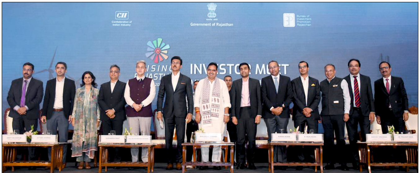
Moments from Mumbai: CM Engages with NRRs at Rising Rajasthan 2024

Led by Hon'ble Chief Minister of Rajasthan Shri Bhajan Lal Sharma launched the Rising Rajasthan Global Investment Summit 2024 with a dynamic investors meet in Mumbai marking the first in a series of roadshows aimed at attracting investment. In one-on-one discussions, the Hon'ble Chief Minister personally engaged with the Non-Resident Rajasthanis (NRRs) in Maharashtra, inspiring them to support Rajasthan's industrial growth in areas like renewable energy, petrochemicals, logistics, etc.