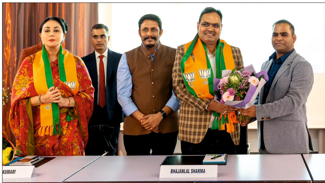
Hon'ble CM Shri Bhajan Lal Sharma in Germany With Hon'ble Deputy Chief Minister Ms. Diya Kumari & NRRs

During a key visit to Germany, Hon'ble Chief Minister Shri Bhajan Lal Sharma led a delegation to forge deeper ties and attract investment into Rajasthan. Germany was invited to be the 'Partner Country' for the Rising Rajasthan Global Investment Summit 2024 and a dedicated industrial zone in Rajasthan for German companies was offered to be set up.