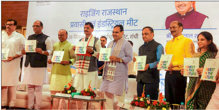
Snapshots from Ranchi