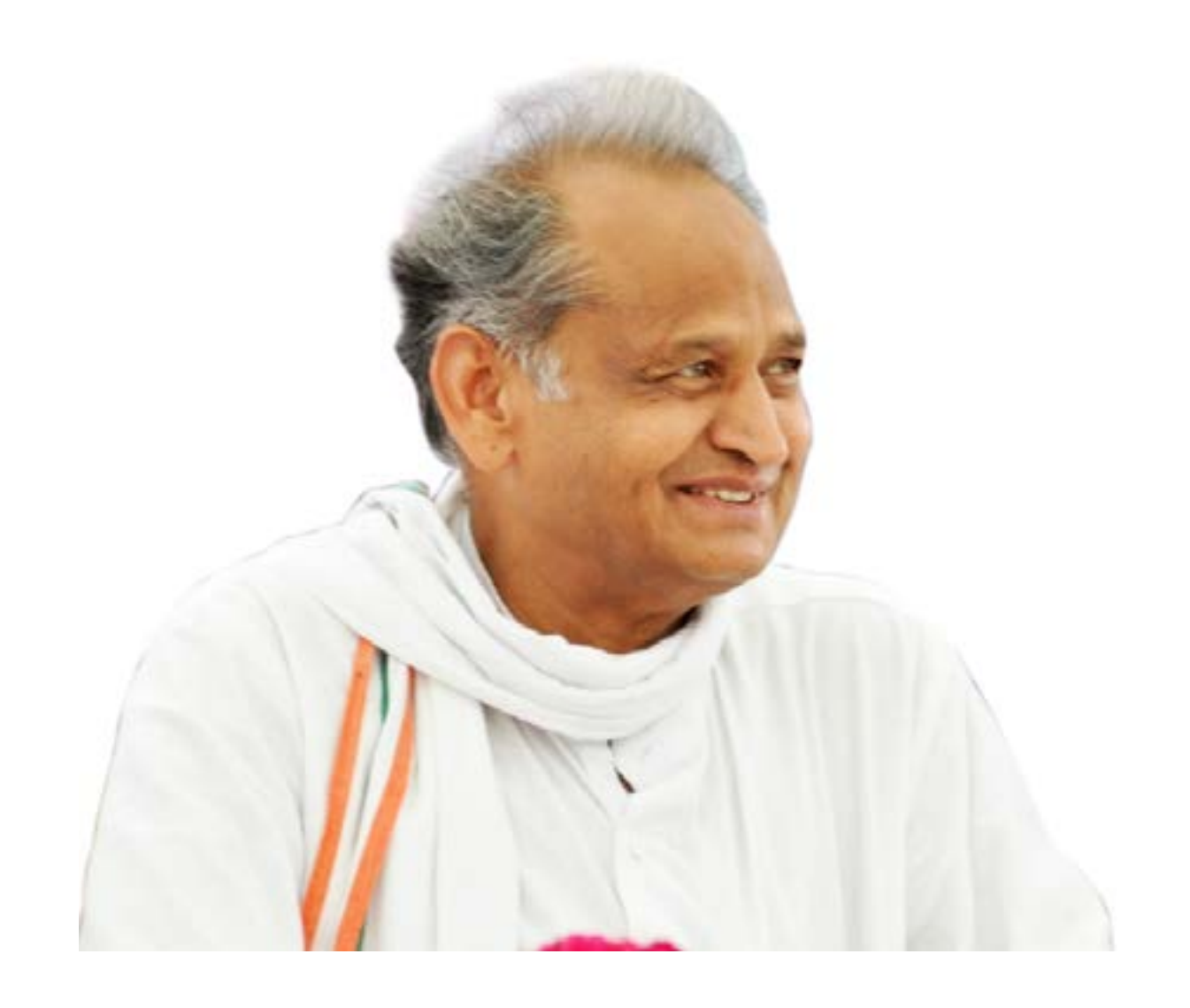
Message received from Hon'ble Chief Minister of Rajasthan, Shri Ashok Gehlot for The Indo-East Africa Trade Expo2023, Kenya